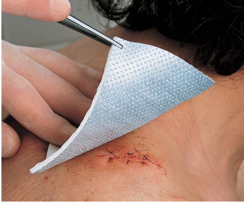
Metalline® Wound Dressing